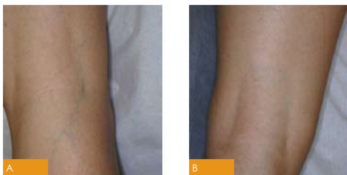
Figure 2. A 40-year old woman with large reticular veins on the right leg (a) and three months after a single treatment with the Cynergy with MultiPlex system (b) at 7 mm spot size (PDL: 6.5 J/cm 2 , 20 ms; Nd:YAG: 40 J/cm 2 , 30 ms; delay: long). Adverse effects were limited to mild, temporary erythema and purpura.

Legs were treated to the appearance of transient blanching of the vessels and without anesthesia, pretreatment care, or posttreatment care. The SmartCool was set at fan speed 5 during all treatments.